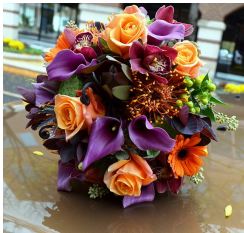
Table Décor $3,000 (2 available)